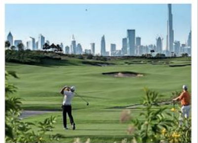
Dubai Hills golf course will play host to the Omega Nations Golf Tour final event.

All qualifying rounds in Dubai including the finals in December, will be held at Dubai Hills Golf club. The 2019 Omega Nation's Tour is held in association with UBS.