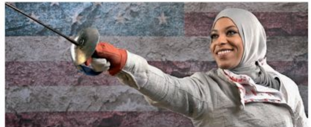
Ibtihaj, bronze medalist at the Rio Games, will attend the Special Olympics in Abu Dhabi.