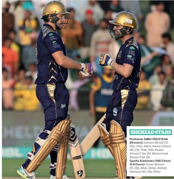
Ahmed Shehzad (right) and Shane Watson's 129-run partnership was instrumental in Gladiators win over Peshawar in the PSL match at the Zayed Cricket Stadium in Abu Dhabi.

Gladiators kept leg on the accelerator as Kieron Pollard and Kamran raised 125 in 14 overs. But Hasnain halted the charge by ending Kamran's (72 from 50 balls) stay with a ripper. Zalmi saw an opportunity to return into the match but Pollard (44 from 23 balls) blasted fellow West Indian Dwayne Bravo and Tanvir to propel Gladiators to 165 runs. In reply, Zalmi skipper Darren